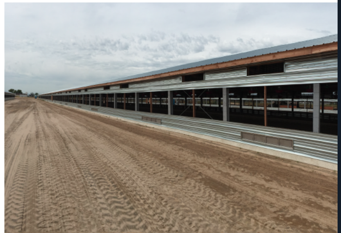
4x1 SMART VENT Custom Configurations