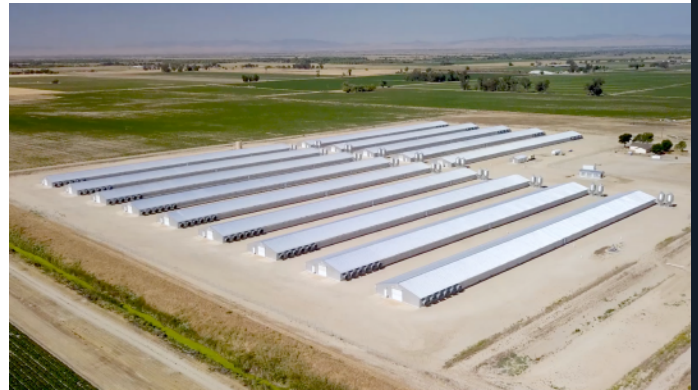
Aerial View of (14) Poultry Housing Facilities

Because the project is so large, consisting of 14 poultry barns with 28,000 sq. ft. each, it would have been very expensive and time consuming to go with their other option of elevating each barn. Elevating each barn would have adversely impacted surrounding properties and communities in the mapped SFHA & flood way. Installing SMART VENT® Engineered Flood Vents was much simpler and a much more cost-effective way to mitigate, as they were able to be installed and incorporated into the existing foundation.